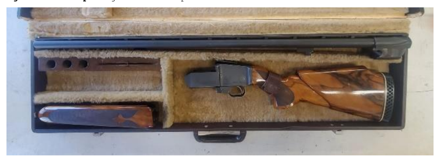
Ljutic DynaTrap Ser. No. 1095 Pro Stock Style Stock

High School Trap: High School Trap Fundraiser.