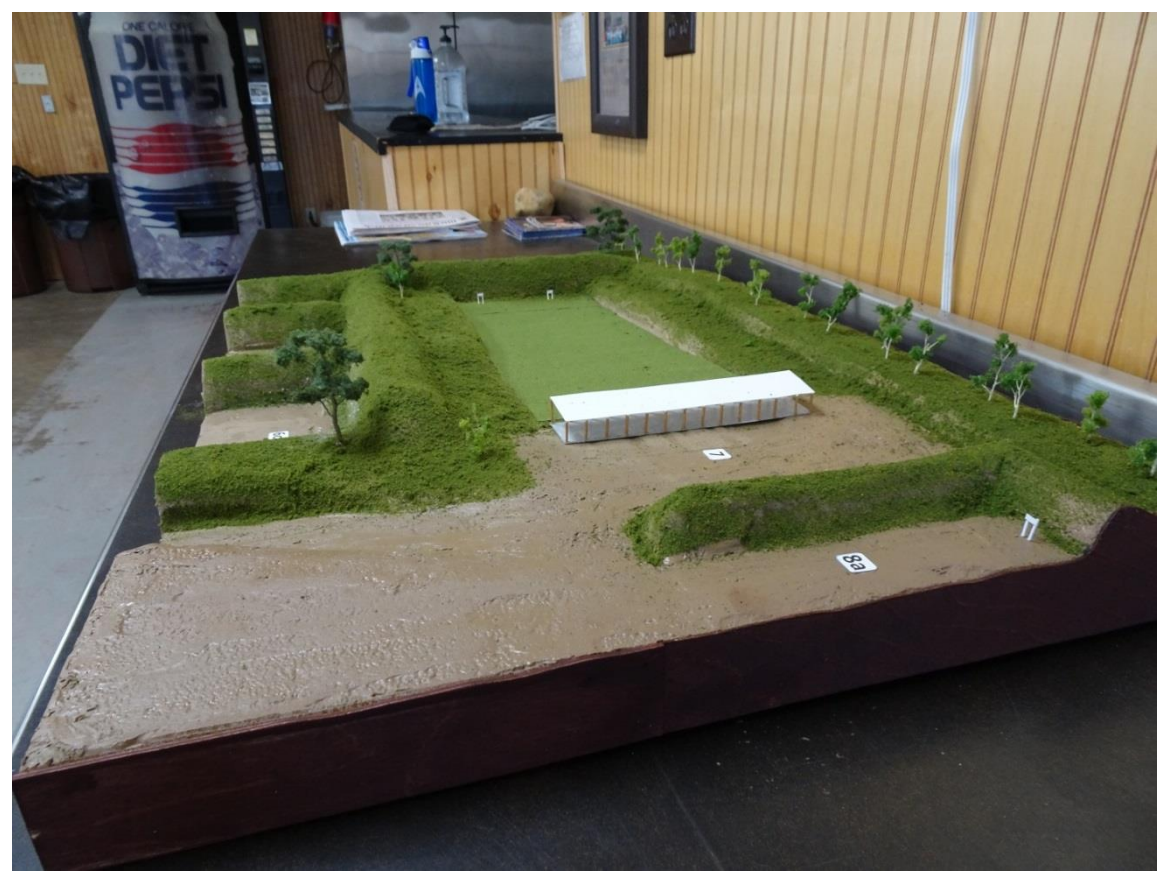
Model of Range 7.