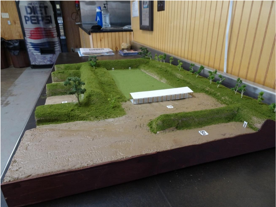
Model of Ranges.