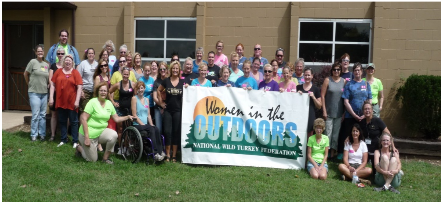
Women In The Outdoors - A Great Event!!