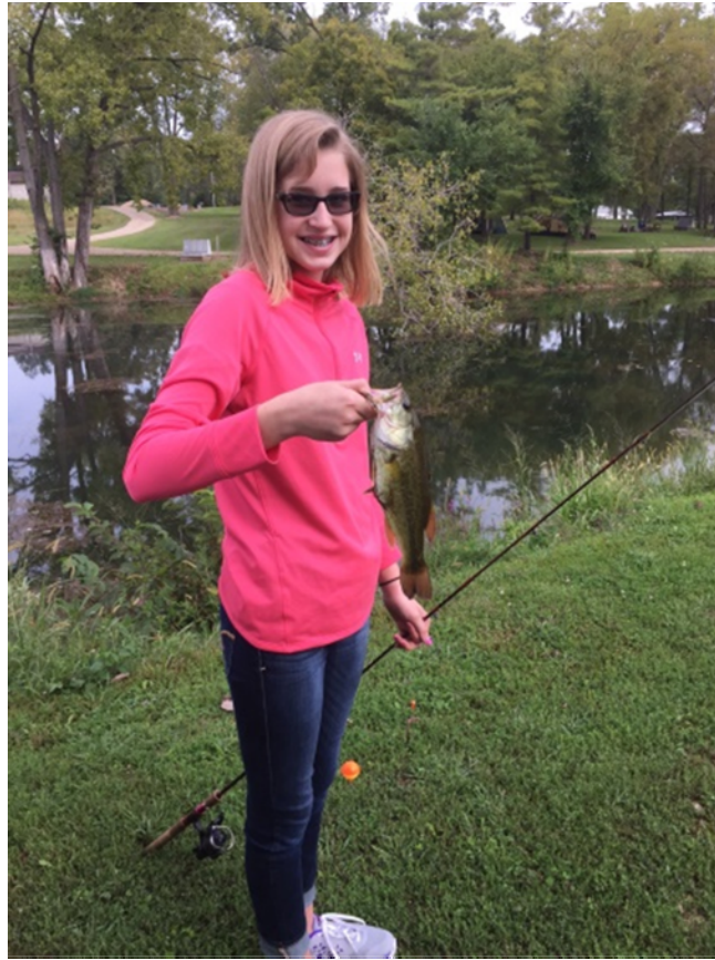
Our Lake Is A Great Resource..... Have Fun