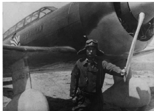
October 15, 1944 The First Kamikaze Attack In The Philippines