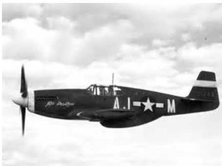
October 26, 1940 First Flight Of The North American P-51 Mustang