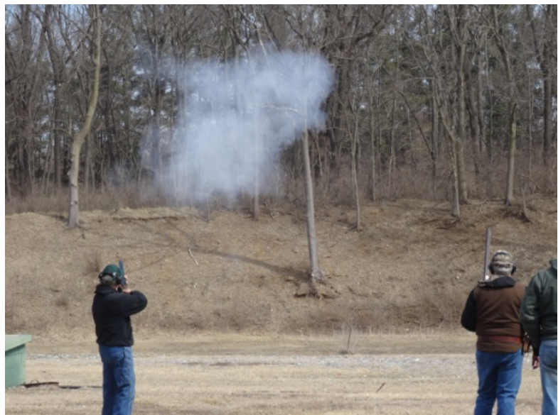
A smokey shotgun, March 6