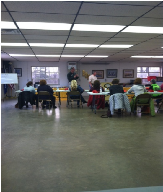
Women on target, 10