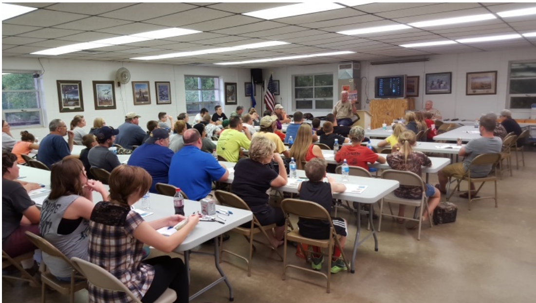
Hunter Ed Class 50 Participants on Aug 8