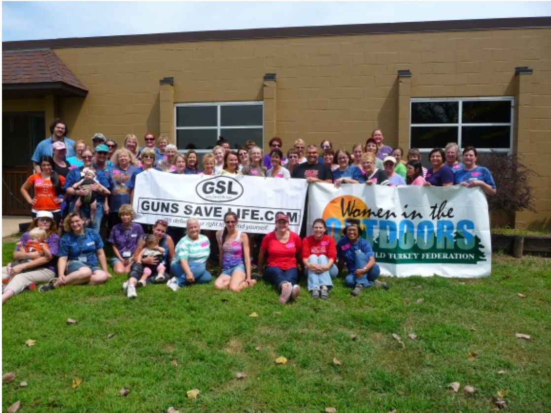
Women In The Outdoors August 22 - 57participants