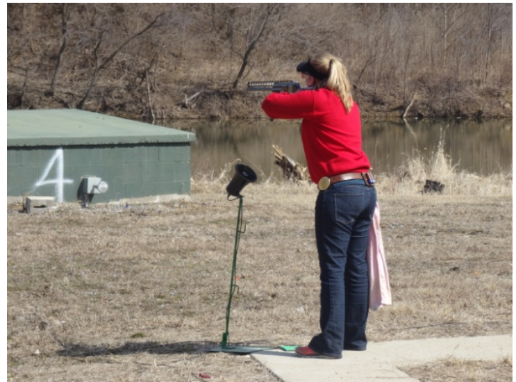
USPSA A Great Turnout On March 22